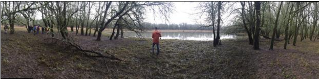
Wetlands on Sauvie Island, Oregon.

Again, from the president's book, "Sometimes your best investments are the ones you don't make." 25 I