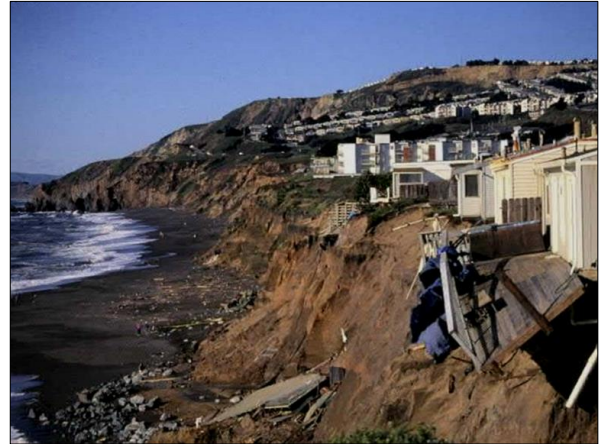
Coastal flood erosion at Pacifica, California.

The Federal Emergency Management Agency is the other primary federal agency focused on national flood issues. FEMA produces maps showing flood hazards for about 1 million of the 3.2 million stream miles in the nation 13 and nearly all coastlines 14 , so people can purchase flood insurance. More than 5.2 million flood insurance policies are currently in effect with over $1.2 trillion in insurance coverage 15 . However, flood losses in the U.S. reached an annual average of $10 billion in the 2000s, a nearly five-fold increase from the early 1900s 16 . In 2016 alone, the