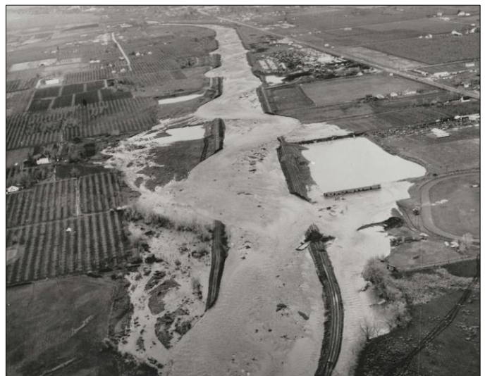
1965 Flood on the Walla Walla River in Oregon.

USACE manages the federal dams and levees in the U.S., part of the nation’s water resources civil works infrastructure. In addition to annual appropriations to maintain these dams and levees, in recent years USACE has frequently requested supplemental appropriations from Congress to cover unanticipated costs incurred for flood-fighting activities and repairs to flood-control infrastructure. For example, from 1987 to 2014 Congress gave USACE $32.2 billion in supplemental funding to augment its $61.3 billion budget for the same period 8 . In other words, natural disasters—mainly flooding from hurricanes—have caused USACE to go 53 percent over their appropriated budgets during that 27-year period.